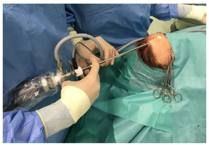
Figure 1: The endoscope is inserted through one incision in the subgaleal plane until the superciliary region is reached, in order to perform the section of the corrugator supercilii, depressor supercilii, and procerus muscles.

Temporarily anesthesia occurs in all patients, which last 163 days on average [5,8,12-15]. Other minor and transient complications reported are: lasting occipital numbness at 1 year (5.7%), intense itching after surgery (5.7%), hypertrophic scar (2.7%), incisional cellulitis (1%) that resolve with oral antibiotics, transient mild incisional alopecia or hair thinning (5%), lasting neck stiffness at 1 year (9%), postoperative epistaxis (4.8%), early sinusitis in the recovery period following septum and turbinate surgery (4.8), slight septal deviation recurrence (12.9%) [3,5,8,9,12-17]. Almost 54% patients undergoing temporal surgery reported slight hollowing of the temple [5]. All patients that were refractory to surgery did not report worsening in their MH at any follow-up. Since the operation does not cause any serious complications or side effects, it can be recommended to patients with severe forms of migraine and symptoms of drug dependency. These patients still have a 50 percent chance of responding with partial or even total relief of their headaches.