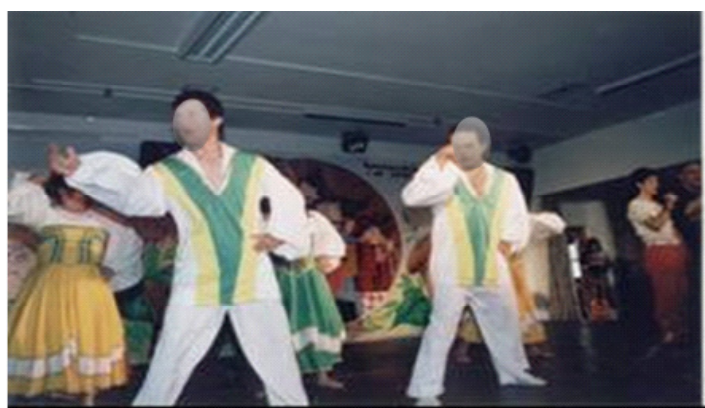
Figure 1: The dance group during performance.

A physical intervention program that meets a multitude of positive aspects has been running in a residential setting, for about 20 years, with a group of 10 young individuals with DS aged 32-35 years. Since adolescence this group has participated in movement and music recreation activities. Using the artistic product of this activity they started to present within their residential center at holidays and special occasions a show that presented their drumming and dancing skills (See Figure 1 ).