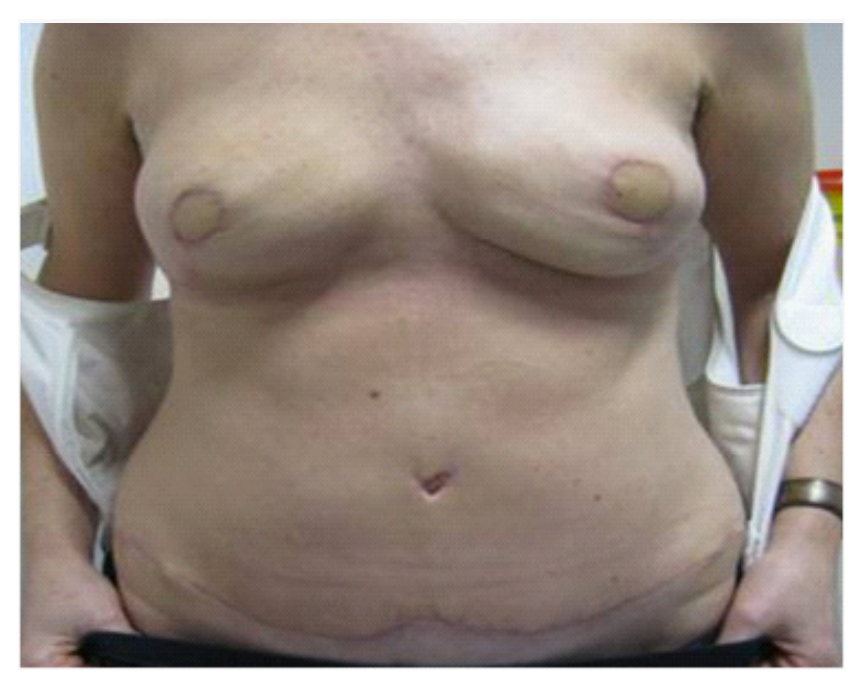
Figure 4: TRAM flap reconstruction